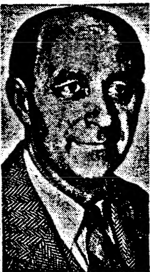
Dr. Enrico Fermi